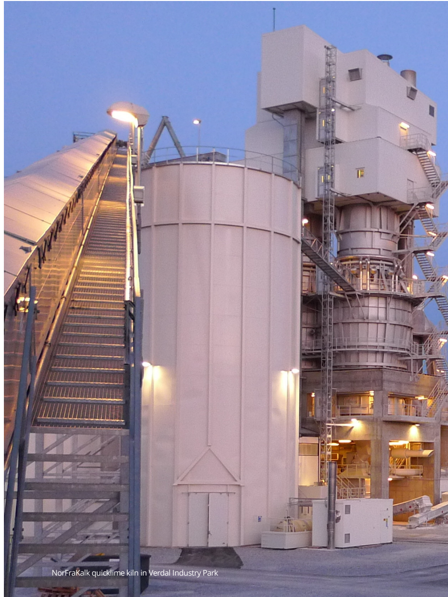
NorFraKalk quicklime kiln in Verdal Industry Park